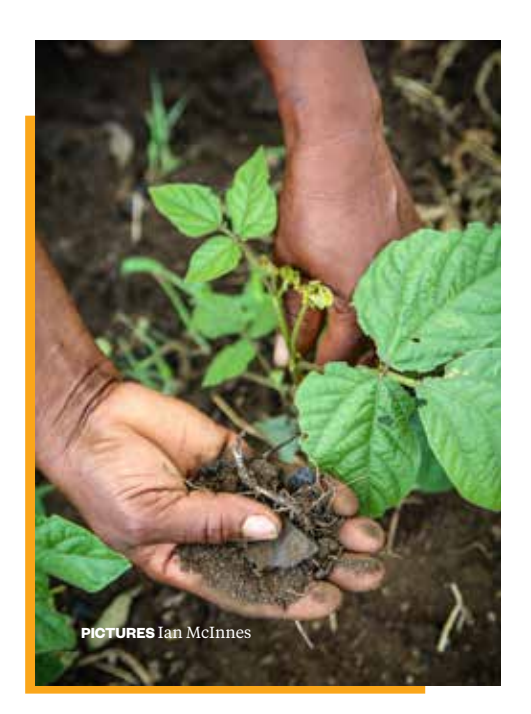
The programme introduced the processing of vegetables.

Unfortunately, a severe winter struck Mongolia again in early 2021, to which Tearfund provided rapid emergency relief to help communities get back on their feet. However, thanks to all our supporters who gave to this project, Mongolian families are more resilient and better off than they were before.