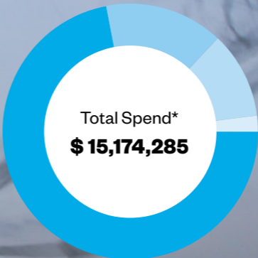
How your money was spent for the year ended 30 June 2019

We combine the commitment of our local team with the expertise of international partners to bring about real change in the lives of those most in need. We nourish communities with life's essentials. We protect the vulnerable from exploitation. We restore hope and peace when disaster and conflict strike. We sponsor children in need, and we empower people to create sustainable livelihoods. Our vision is to see individuals and communities around the world transformed by hope, opportunity and dignity. We invite you to join us in making a real difference.